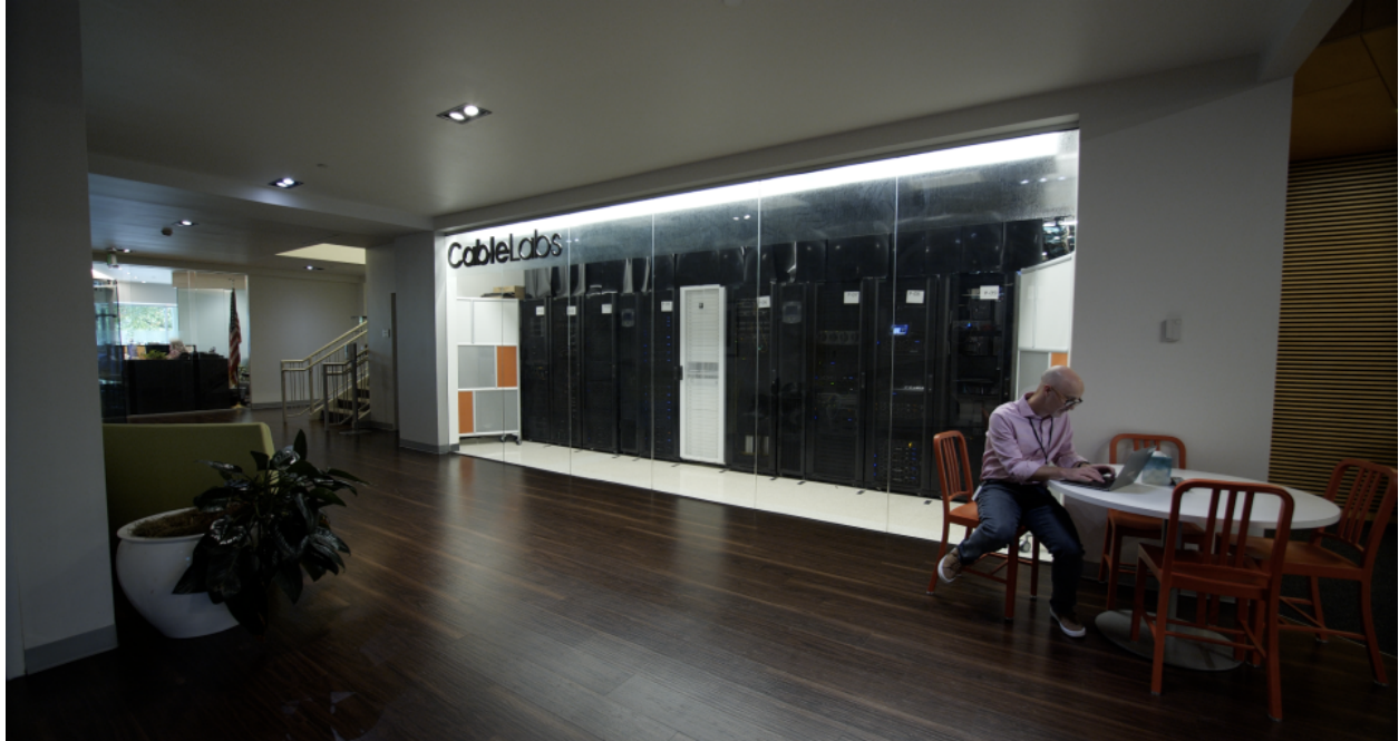
CableLabs®, the host lab of the 2022 5G Challenge Preliminary Event.