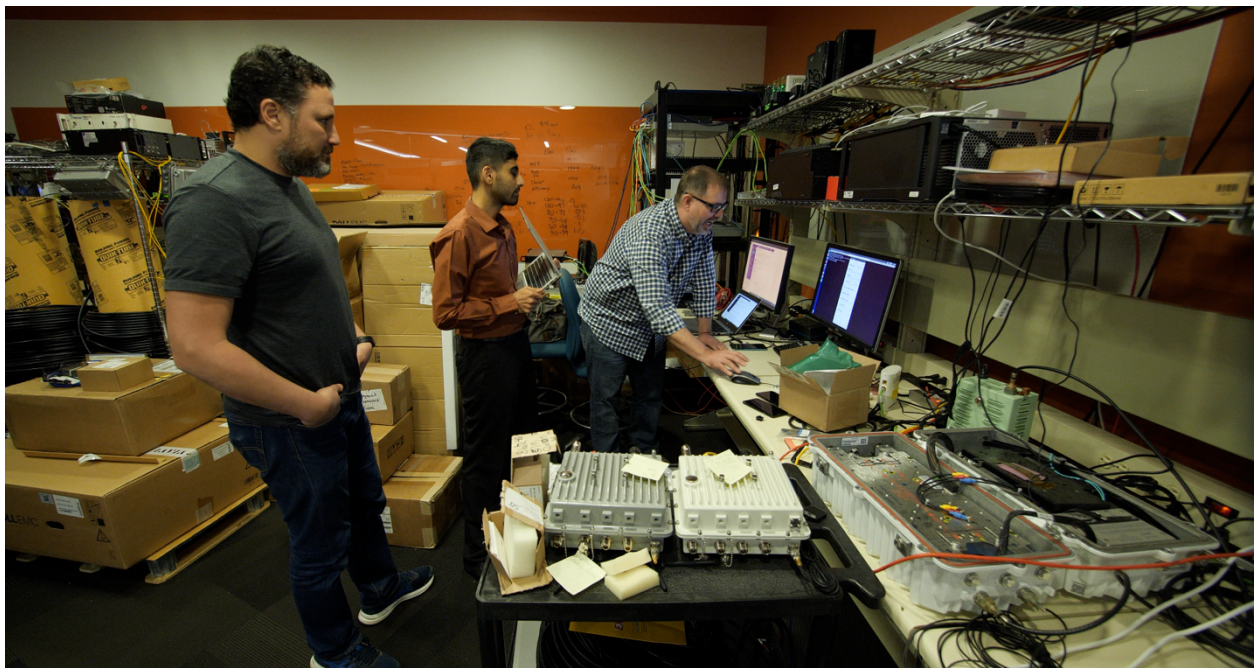
CableLabs ® , the host lab of the 2022 5G Challenge Preliminary Event.