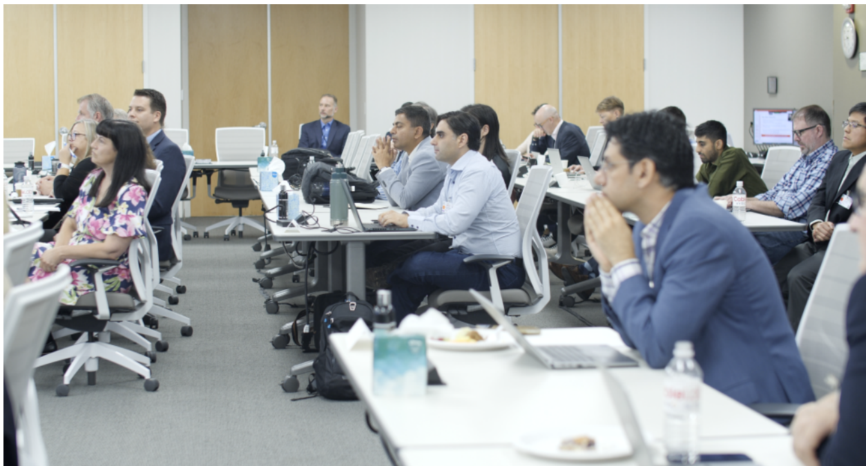
2022 5G Challenge Preliminary Event Closing Ceremony.